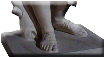
The sandals worn by the statue of Artemis shown in full view on the next page.

Though Greeks often went barefoot around the house, a variety of shoe styles were available, from sandals to boots.