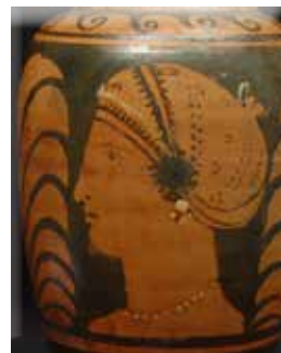
A woman with her hair wrapped in a scarf.