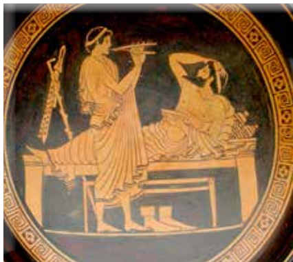
Note that the reclining man shown on this cup has put his shoes underneath this couch and that the musician is barefoot. Both men wear headbands.