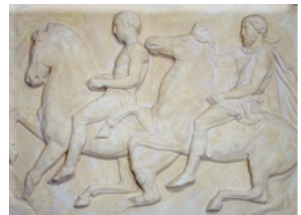
Horsemen in chitons from the Parthenon frieze.

Working men, who needed greater ease of movement, wore a chiton. Unlike women's chitons, those of men went only to the knees. As shown on the frieze sculptures here, the men could, if desired, attach the top of the cloth at one shoulder only or tuck the top of the cloth into the waist belt.