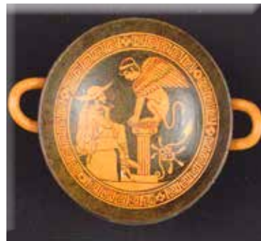
Oedipus is dressed for travel in his wide-brimmed hat, cloak, and shoes.